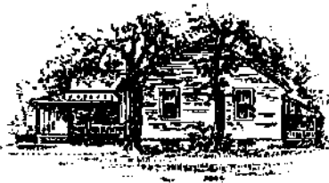
Fell Creek Meeting House Pendleton, Indiana 1857