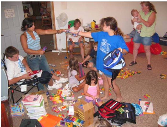
Youth stuffing backpacks at IYM 2005.

Resource: Wilmer Cooper’s Pendle Hill pamphlet “The Testimony of Integrity in the Religious Society of Friends”. This will be pro-