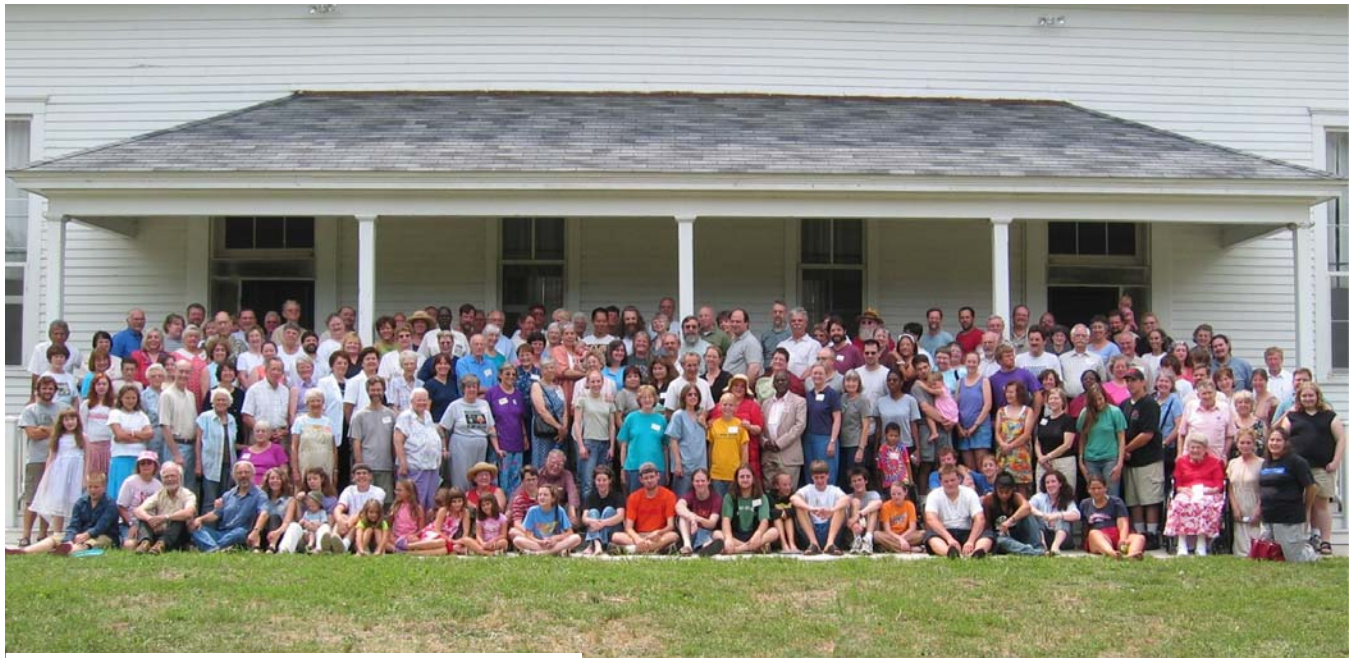
Gathering at Illinois Yearly Meeting 2005