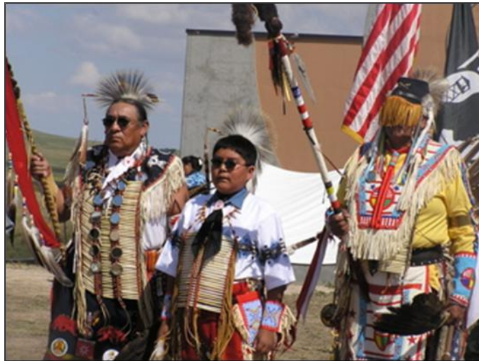
Oglala Lakota College graduation

My journaling group sits in the cool, darkened room on this hot, bright summer afternoon, listening to Native American flute music. The cool, sweet music is so different from the Lakota chants and drumming I heard so often during our recent stay on the Pine Ridge Reservation: at the Oglala Lakota College graduation, at the powwow the same afternoon, at the Leonard Peltier commemorative ceremony and walk the next day, in 100 degree heat, and on KILI Radio out of Porcupine.