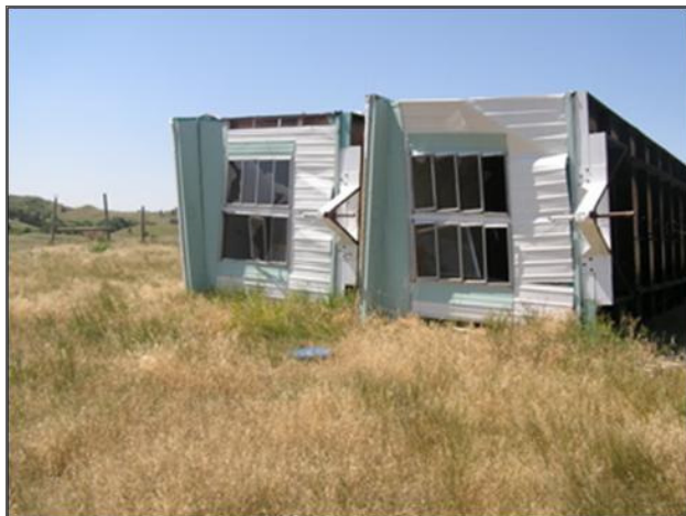
Double-wide, turned on its side

Register in Rapid, a hundred miles away!?! All