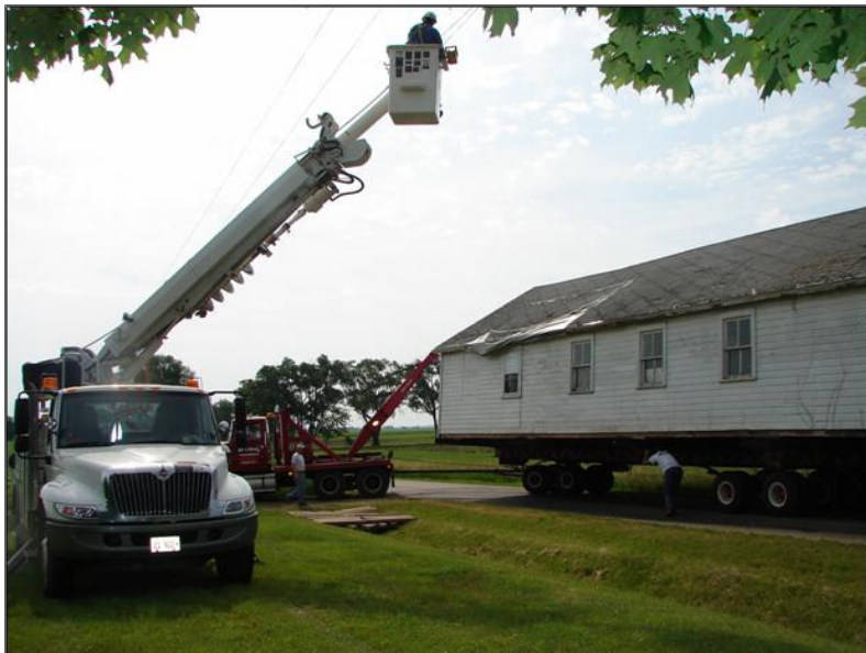
Moving of Junior Illinois Yearly Meetinghouse at Clear Creek