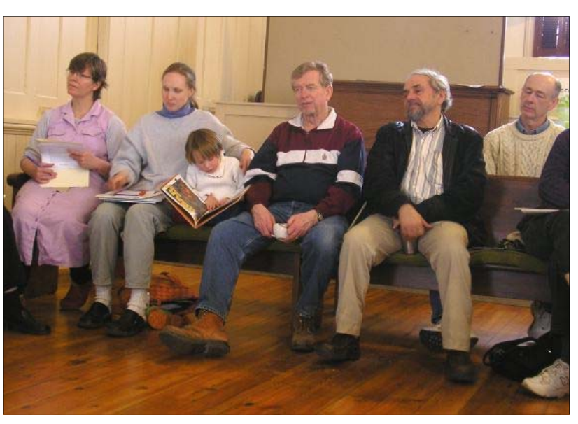
IYM committee and volunteers listen to fundraising strategies.

The generosity of IYM Friends has provided the hands-on and financial resources to complete the restoration of our historic meetinghouse and recycle two side buildings into new sleeping options for IYM families and teens. The