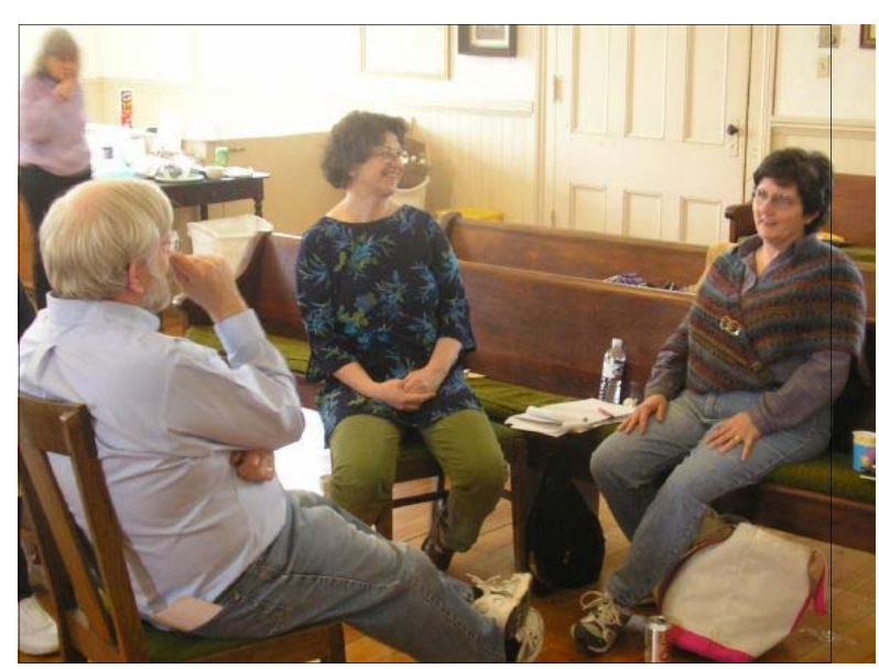
Participants role-play asking a Friend to support the future of IYM.

combined gifts from eight monthly meetings and 56 IYM families have provided over $350,000 to the property improvement fund to make this all happen. Look for a special celebration of the conclusion of this work at our 2007 Session (see back cover)!