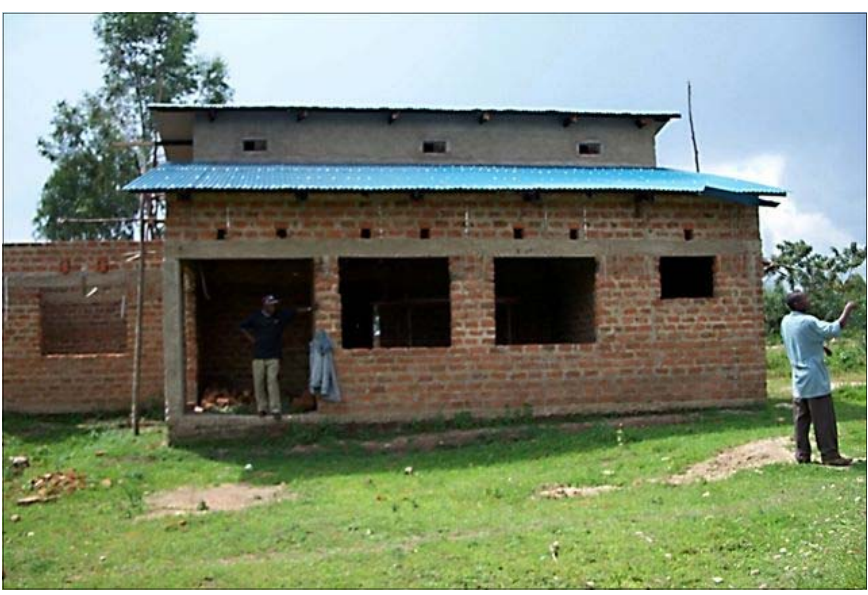
Work campers will continue building the Peace Center in Lubao, Kenya.

The African Great Lakes Initiative (AGLI) is a program created by the Friends Peace Teams, an organization that supports the traditional emphasis of Quakers in promoting a more peaceful world. AGLI endeavors to break cycles of violence in the Great Lakes region by working at the grassroots level to teach people to resolve their conflicts without violence and to